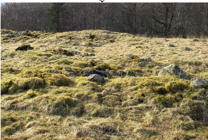
House 2 (viewed looking west)