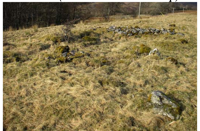
House 3 (viewed looking north)

Houses 4, 5 & 6 should now lie in a small deciduous wood, but upon investigation no trace could be found. Houses 1, 2 & 3 are all of the same size & layout, one large long room with a byre on the end.