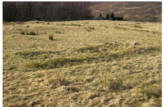
House 1 (not indicated on O/S map)