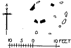
FIG. 295—Chambered Cairn at foot of Beinn na Caillich

659. Chambered Cairn and Indefinite Remains at foot of Beinn na Caillich.—On boggy ground at the foot of Beinn na Caillich, on its east side, are the much-scattered remains of a chambered cairn and an adjoining structure of indeterminate character which may possibly represent a much broken circle or the remnants of a second cairn. The chambered cairn has apparently been of a somewhat oval form, with its longer axis, approximately 28 feet, lying due N. and S.