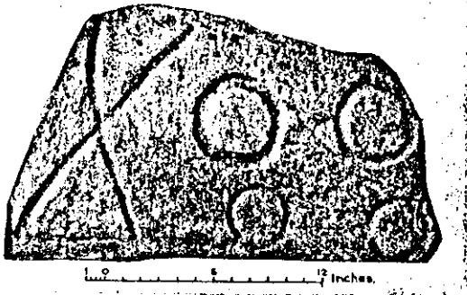
Fig. 1. Cast of a Sculptured Stone once in Nonikiln Kirkyard, Roskeen, Ross-shire. (5)