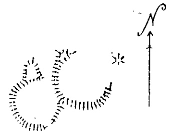
Hut 'C': Scale 1:1250

The field system is defined by stone clearance heaps, which the R C A H M describe as "mounds", field walls, and lynchets forming cultivation plots, about 30.0m by 20.0m average size. (OSFI:NKB:17.11.1969)